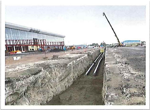
Hydrant construction