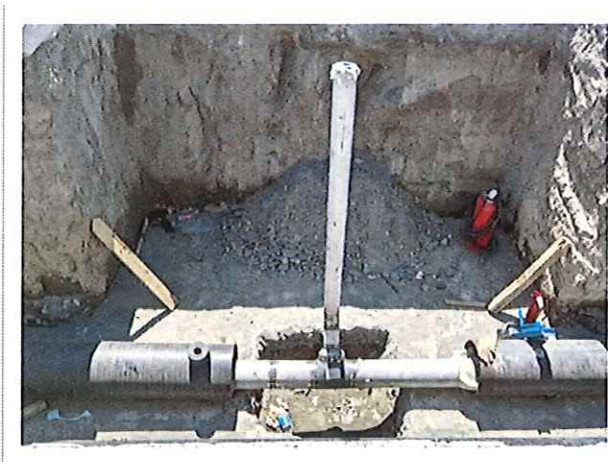
Building antennas