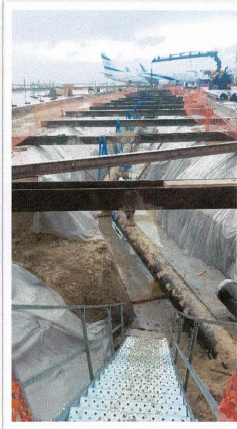
Pipe replacement phase