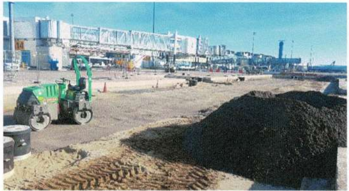
End of backfilling works