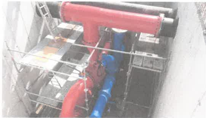
Connecting the pipes to the project