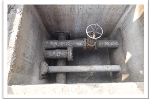
View of hydrant chamber