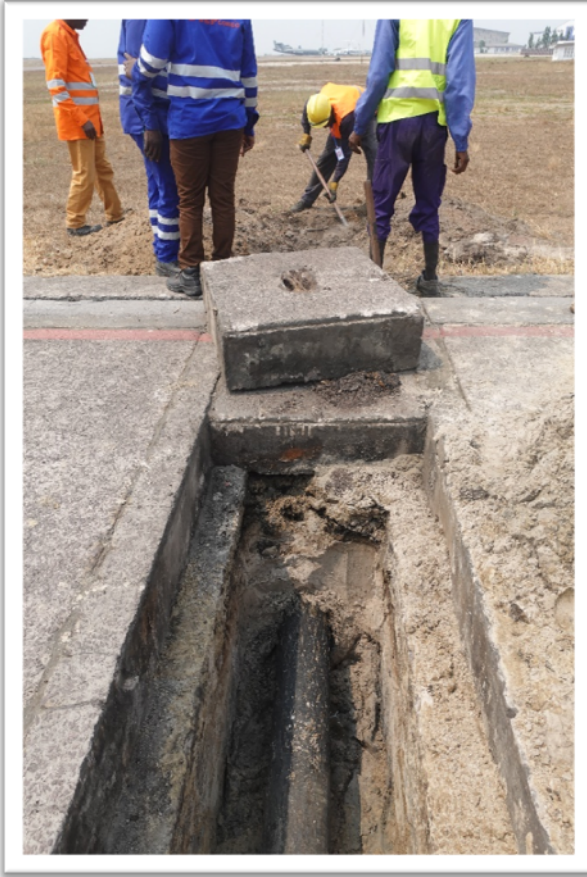
View of channel pipe