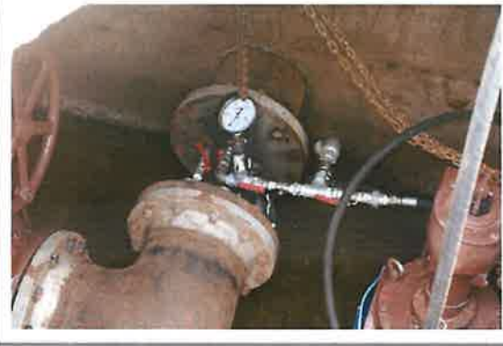
Hydrant system pressure test