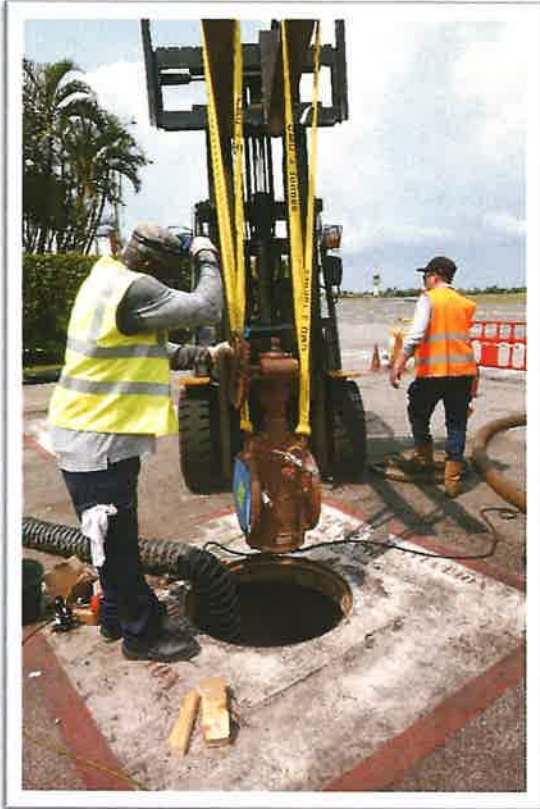
Installing a DBB