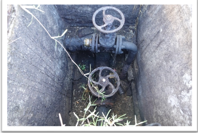
View of valves room