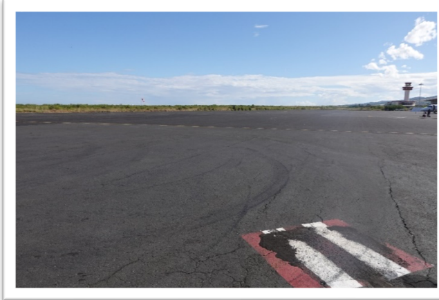
View of a tarmac